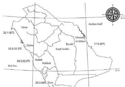
Figure 2. Water temperature range of aquaculture regions in Saudi Arabia.

Environmental constraints extend to the coastline, where seawater salinity typically ranges from 42‰ to 45‰, which is significantly higher than the ideal larviculture range of 10‰ to 33.5‰. High water temperatures, fluctuating between 17.5°C and 35°C, further limit species suitability and operational feasibility (Figure 2). Beyond these natural factors, strict government regulations on well drilling and groundwater extraction make freshwater a high-cost component. The combined burden of hypersalinity and water scarcity remains a primary bottleneck for the industry.