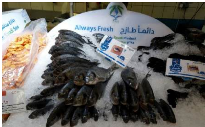
Farmed products certified by the Saudi national aquaculture certification and labeling program (SAMAQ), which guarantees premium quality and food safety.

Despite limited natural water resources and a relatively late start, Saudi Arabia's aquaculture sector has developed steadily over the past two decades. This growth has been underpinned by strategic government policies, robust disease control, species adaptation, and industry guidance aimed at structural transformation. However, to ensure long-term environmental and industrial sustainability, it remains essential to scale up local hatchery production further, strengthen biosecurity frameworks, adapt farming systems to local species, and cultivate specialised local talent.