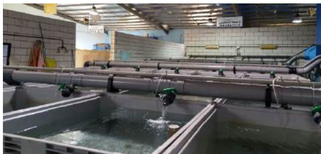
A fish hatchery in Saudi Arabia.

necessitating imports to meet high domestic demand. To mitigate disease risks and climate vulnerability, MEWA is pursuing the commercialisation of native species, such as snubnose pompano and sobaity seabream, to strengthen the sector’s long-term resilience.