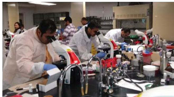
Capacity-building and technical training for national officials.

MEWA collaborates with local universities, international organisations, and national research centres to improve technology transfer. Through practical workshops and technical training, local professionals are enhancing their expertise to support the ongoing development of the national aquaculture sector. These centres offer technical assistance, consultation, and high-quality fry to farmers to elevate the standards of local operations. On the biosecurity front, MEWA regularly convenes industry leaders for seminars and maintains a rigorous national tracking system for aquatic diseases. Stringent regulations govern the import of live fish, restricting permits to licensed operators to prevent pathogen outbreaks. Furthermore, the Ministry provides farmers with comprehensive biosecurity manuals and conducts regular farm monitoring to ensure compliance.