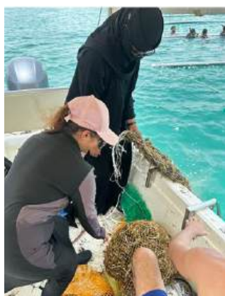
Young Saudis, including women, are actively involved in seaweed production.

Regarding coastal operations, MEWA is actively encouraging the adoption of Recirculating Aquaculture Systems (RAS) to maximise water efficiency. The Ministry is also designating specialised aquaculture zones and diversifying cultivated species to streamline production. Along the coastline, new initiatives for seaweed and algae cultivation are being implemented to stimulate regional development. These strategic efforts aim to drive economic growth in coastal communities, fostering local engagement and creating long-term, sustainable employment opportunities.