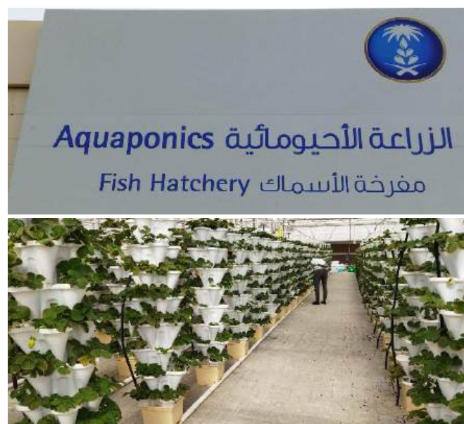
The Ministry of Environment, Water and Agriculture MEWA is actively promoting Integrated Agri-Aquaculture (IAA) and aquaponic systems.

To safeguard finite groundwater resources, MEWA has implemented a dual approach: rigorous monitoring and pumping quotas coupled with the active promotion of Integrated Agri-Aquaculture (IAA) and aquaponic systems. Innovative initiatives, such as the cultivation of Azolla within aquaculture ponds as organic fertiliser and protein-rich feed, are also underway. Consequently, IAA practices have flourished in Al-Qassim, Al-Ahsa and Riyadh. In these clusters, farmers utilise deep groundwater for tilapia rearing, subsequently repurposing the nutrient-rich effluent for crop irrigation. This synergy optimises water-use efficiency and enhances agricultural circularity.