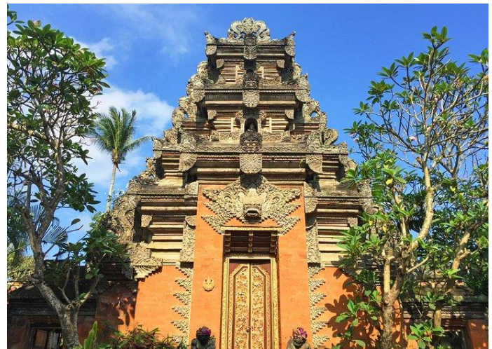
Ubud - the heart of Balinese art and culture, this is where the contemporary Balinese art movement originated, with the nearby royal palaces and temples serving as its primary patrons.