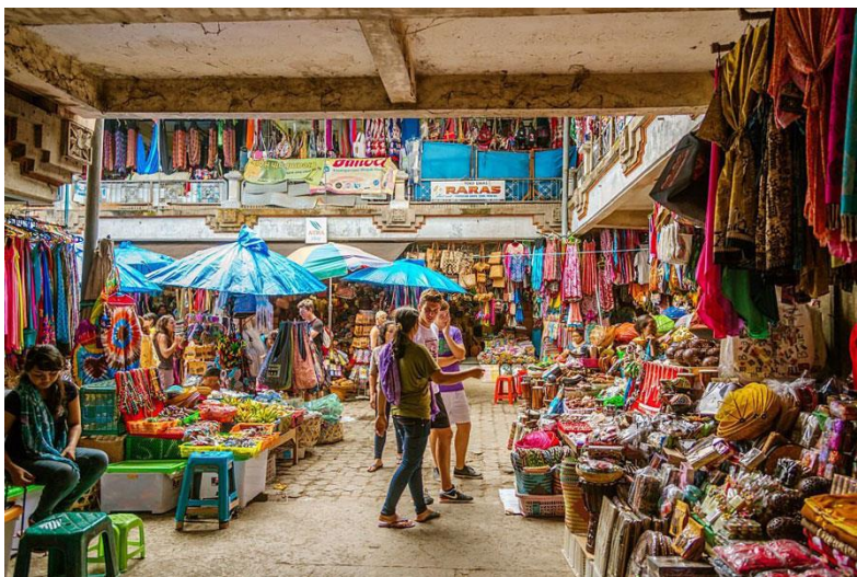
Ubud Art Market - carvings, sculptures, jewelry, sarongs, paintings, and homewares and is one of the top tourist attractions in Ubud.