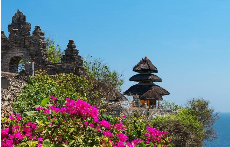
Uluwatu Temple - one of the Bali's most famous temples, thanks to its magnificent clifftop setting. It presides over plunging sea cliffs above one of Bali's top surfing locations.